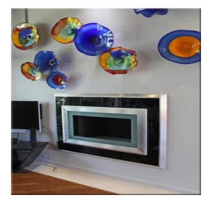
Custom Fireplace Surrounds