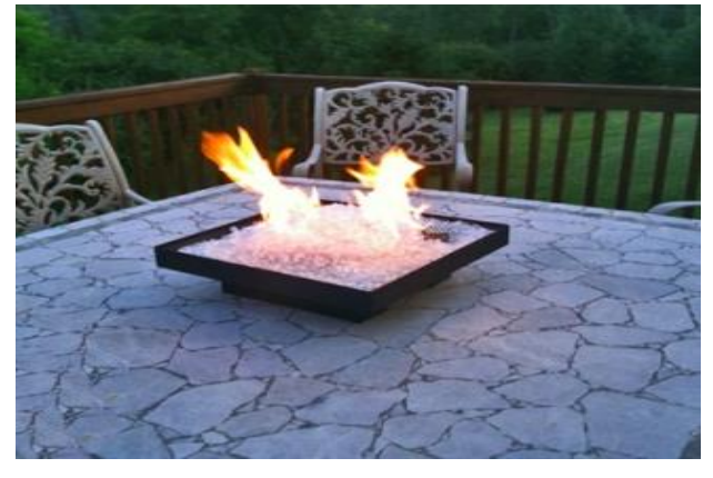
Table Top FIRE PITS