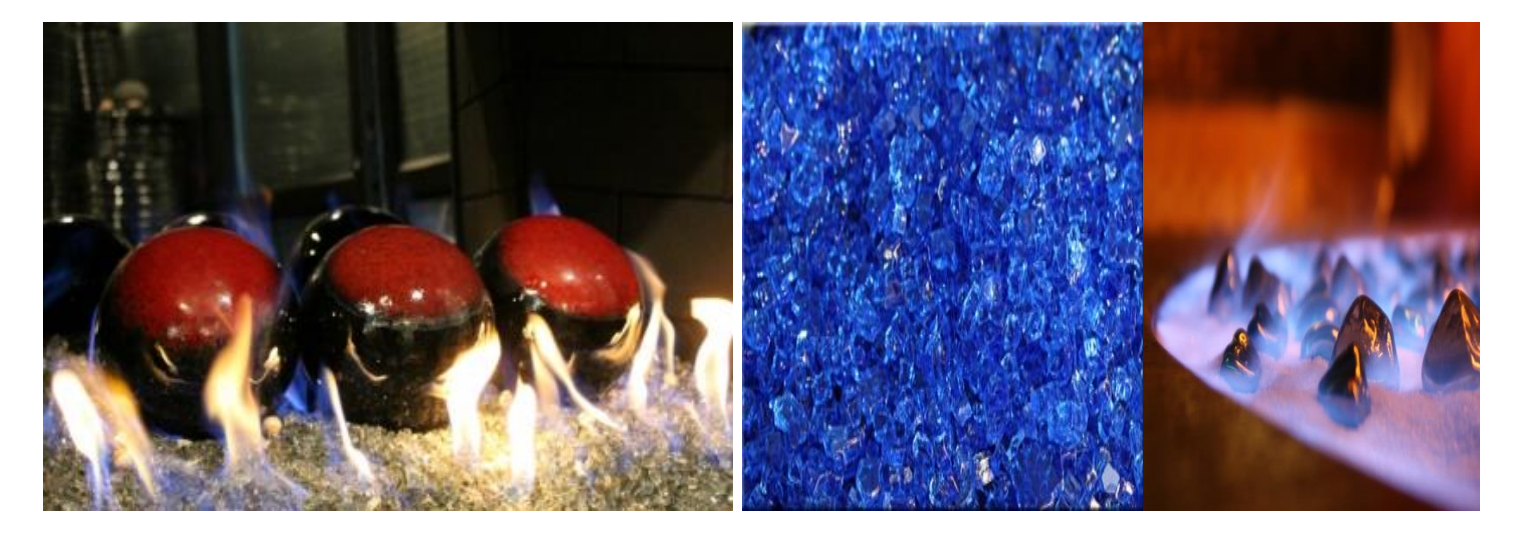
High Fire Porcelain Coated Fireballs | Various Colors

FireGlass (patented) | Glass Toppers | Various Colors