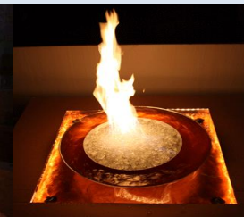
Fire Water Feature