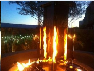
Swirling Fire Vortex