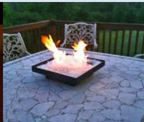
R.V Fire Pits